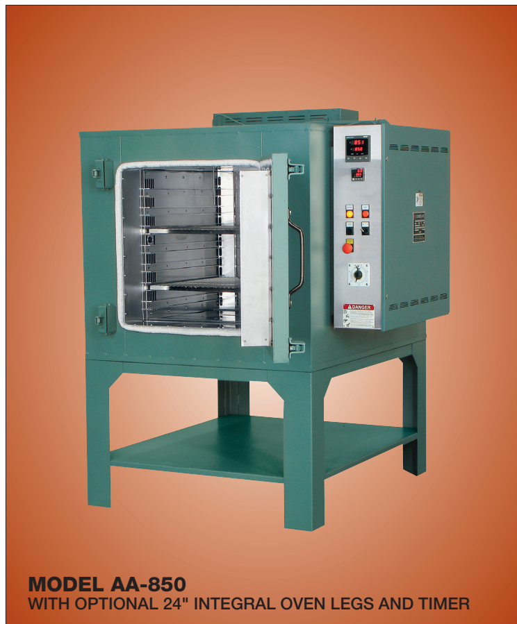
MODEL AA-850 WITH OPTIONAL 24" INTEGRAL OVEN LEGS AND TIMER