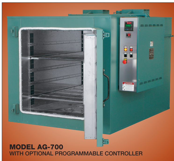
MODEL AG-700 WITH OPTIONAL PROGRAMMABLE CONTROLLER