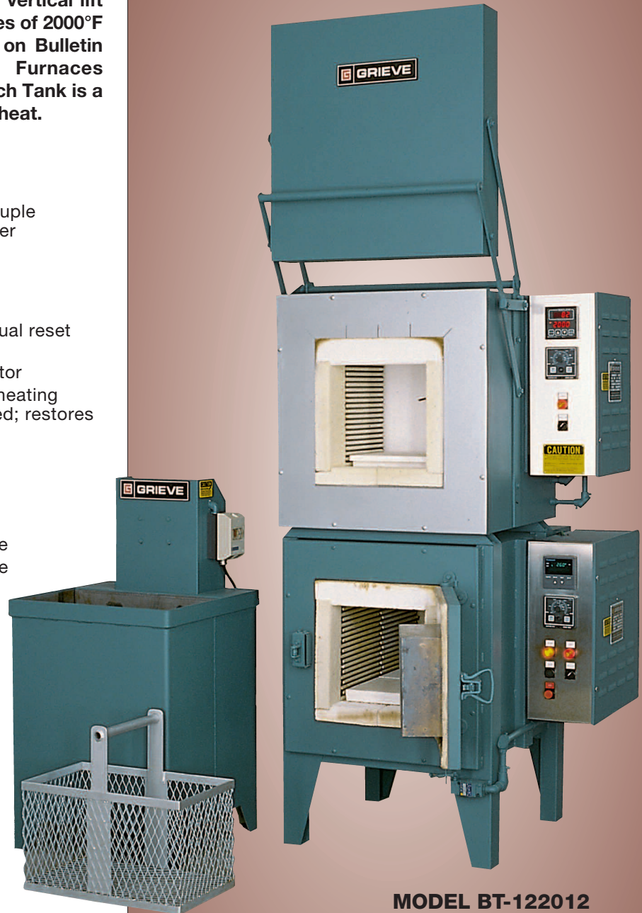
MODEL BT-122012 TEMPERING FURNACE