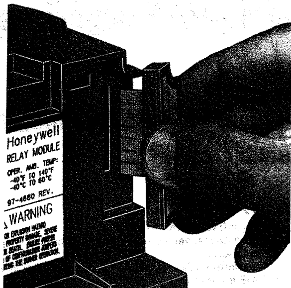
Fig. 1. Purge card installation.