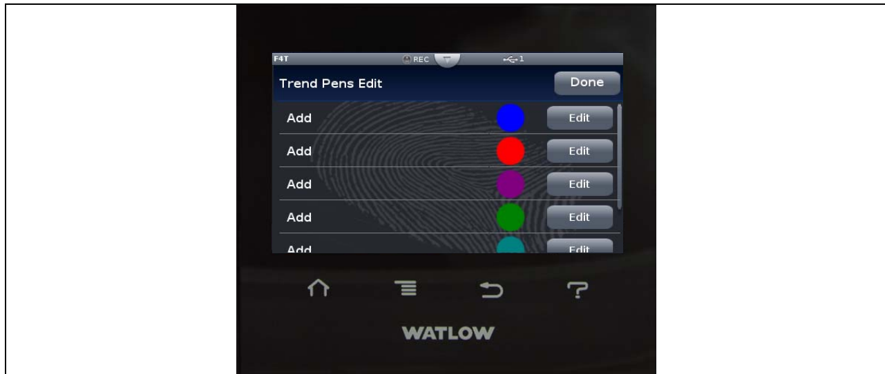
Fig. 5: TREND PENS EDIT