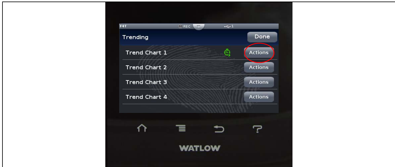
Fig. 3: TRENDING SCREEN