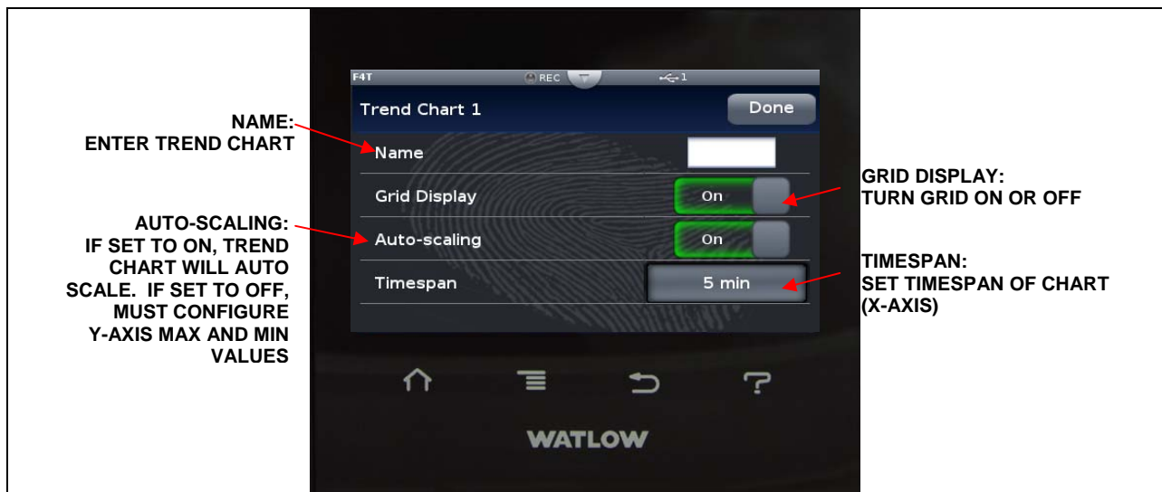
Fig. 4: TREND CHART SCREEN