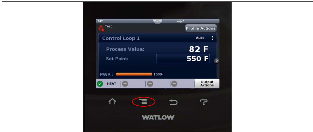
Fig. 1: HOME SCREEN