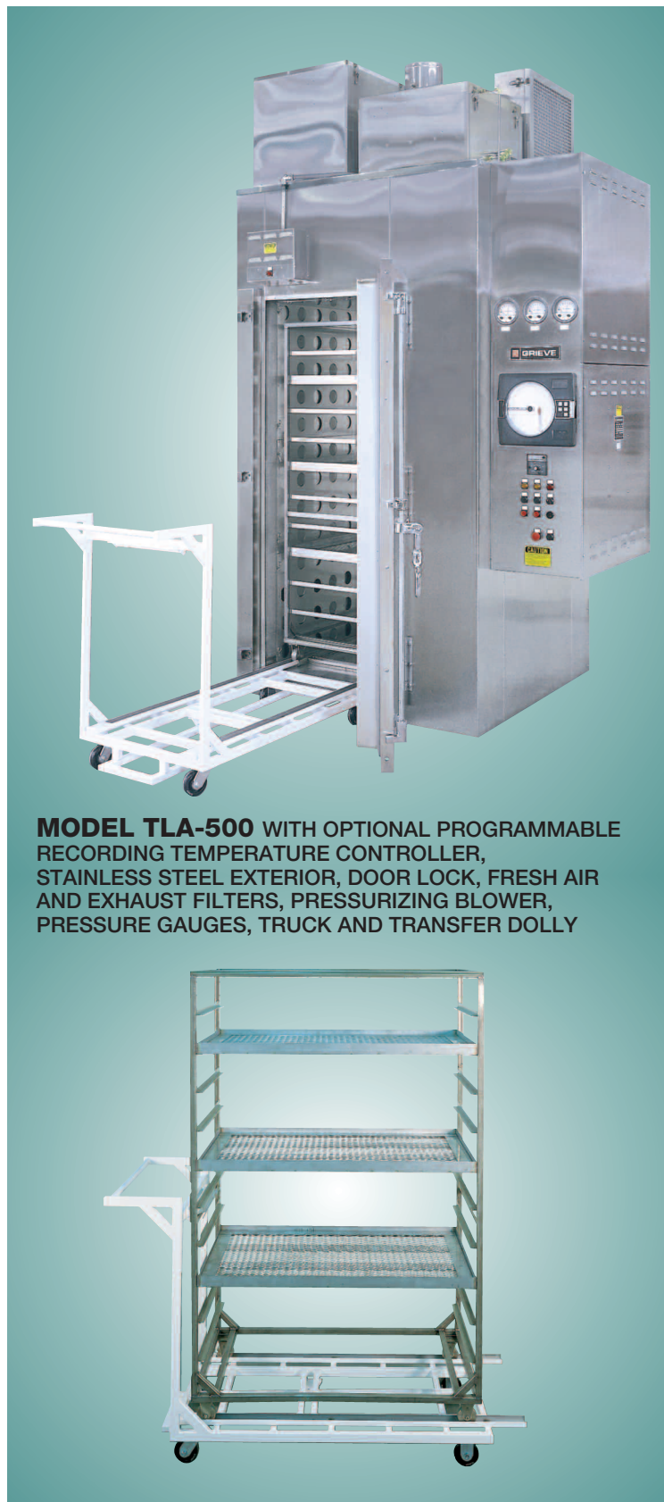
MODEL TLA-500 WITH OPTIONAL PROGRAMMABLE RECORDING TEMPERATURE CONTROLLER, STAINLESS STEEL EXTERIOR, DOOR LOCK, FRESH AIR AND EXHAUST FILTERS, PRESSURIZING BLOWER, PRESSURE GAUGES, TRUCK AND TRANSFER DOLLY