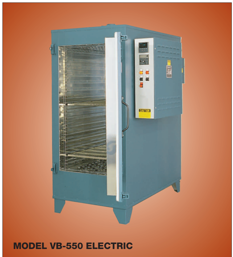
MODEL VB-550 ELECTRIC