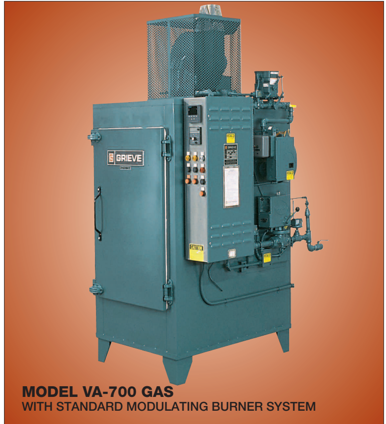
MODEL VA-700 GAS WITH STANDARD MODULATING BURNER SYSTEM

HEAVY DUTY ELECTRIC AND GAS VERTICAL AIR FLOW CABINET OVENS