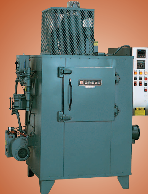
MODEL HA-700 GAS WITH STANDARD MODULATING BURNER SYSTEM

HEAVY DUTY ELECTRIC AND GAS HORIZONTAL AIR FLOW CABINET OVENS