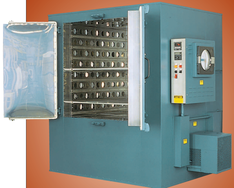
MODEL HC-850 ELECTRIC WITH OPTIONAL PROGRAMMING TEMPERATURE CONTROLLER AND RECORDING THERMOMETER