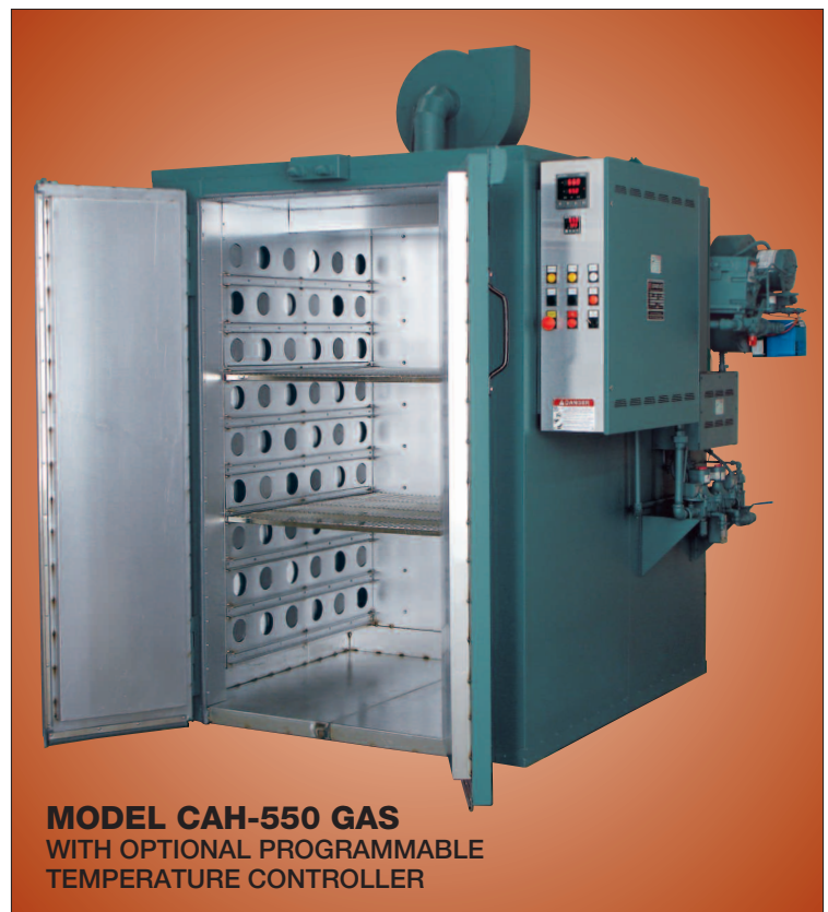
MODEL CAH-550 GAS WITH OPTIONAL PROGRAMMABLE TEMPERATURE CONTROLLER