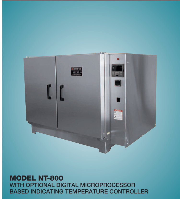
MODEL NT-800 WITH OPTIONAL DIGITAL MICROPROCESSOR BASED INDICATING TEMPERATURE CONTROLLER

Same as Model NT-1000, plus recirculating blower system to improve temperature uniformity and reduce heat-up time of oven and parts.