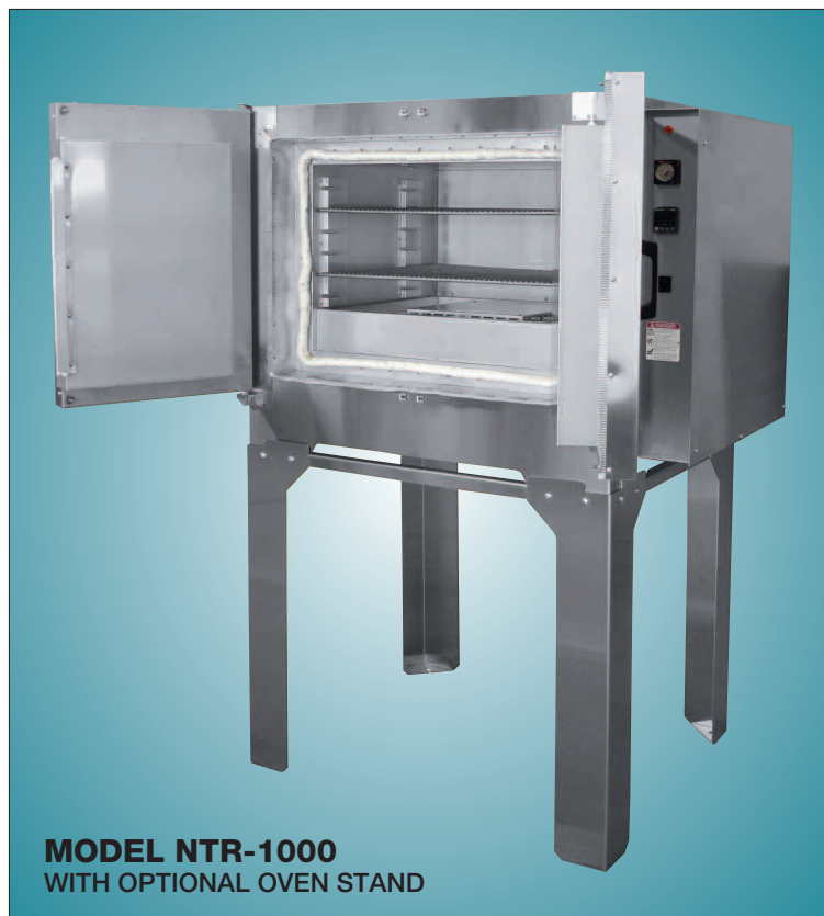
MODEL NTR-1000 WITH OPTIONAL OVEN STAND